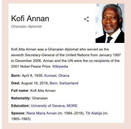
Figure 2. Google Knowledge Graph node as shown after searching on google.com for the term “Kofi Annan.”

loosely interlinked individual subgraphs, each of which is governed by its very own structure, representation schema, and so on. Knowledge graphs, in contrast, are usually understood to be much more internally consistent, and more tightly controlled, artifacts. As a consequence, the value of external links—that is, to external graphs without tight quality control—is put into doubt, y while quality of content and/or the underlying schema comes more into focus.